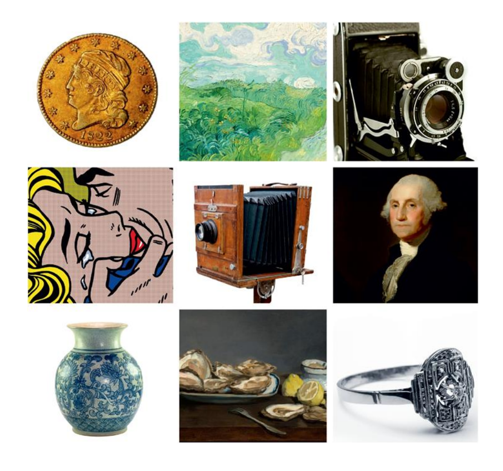
INSURANCE FOR THE GALLERY